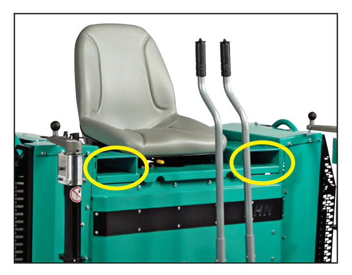
Fork truck pockets built into an ergonomically designed seat frame